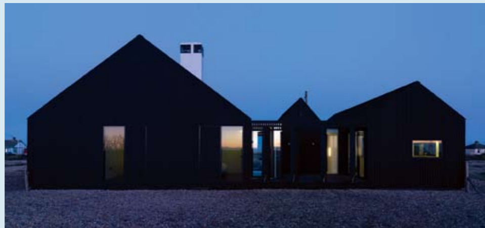
Above Shingle House; Below Dune House

Hopkins Architects designed The Long House in Norfolk, a fusion of old-style building techniques with modern technology. It incorporates a huge, traditionally-crafted flint wall and a vast timber roof, reinforced with steel cabling and trusses assembled into an intricate sculptural construction.